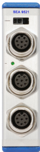
Fig. 1: Front side

The encoder channel terminals have a M12 female connector and accept only encoders with M12 male connector. Matching encoder connectors can be obtained from S.E.A.: